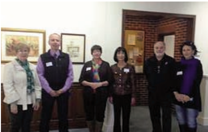
New Artist Members